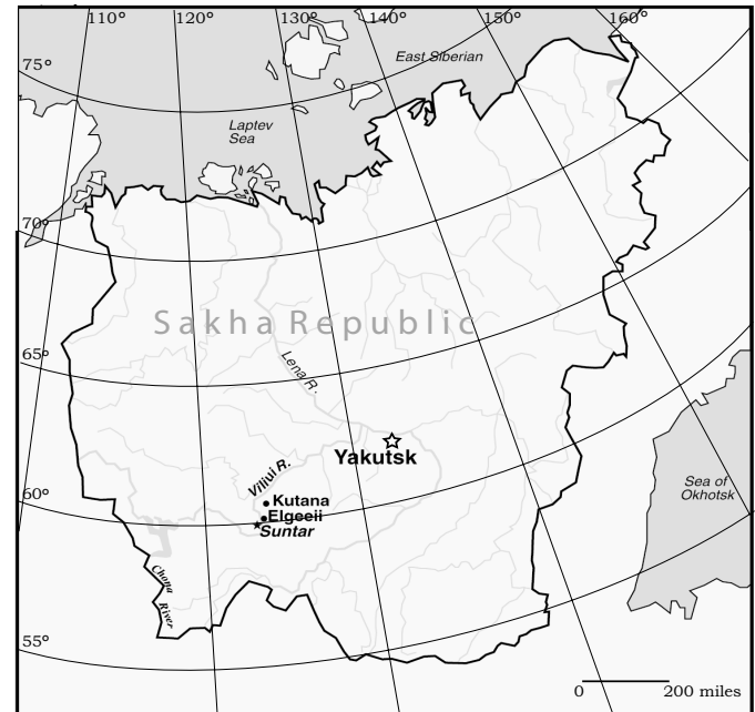
FIG. 1. The Sakha Republic, showing the capital city, Yakutsk, the Viliui River, the base research villages, Elgeei and Kutana, and the Suntar regional center.

The existing efforts to investigate indigenous sustainability in the Russian North have no aspect of working within local communities specifically to define sustainability (Krupnik, 1993; Pika, 1999; Jernsletten and Klovov, 2002). Local investigation is a crucial step. By working within communities and discussing what they and the coming generations need for a sustainable future, it should be possible to see what aspects of contemporary life do and do not work. The investigative process should also clarify the obstacles to achieving local definitions. The case reported here is an attempt to test this research approach.